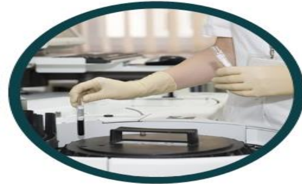
Public Health & Tropical Medicine