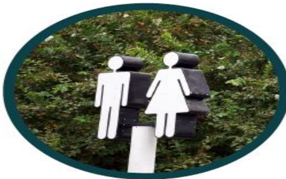
Gender and Development Studies