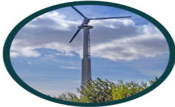
Ecology & Sustainable Development

Transversal and translingual innovation research units on priority areas